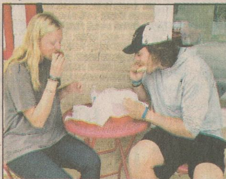
Enjoying a Slug Burger at the Front Street Snack Bar